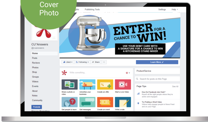
Facebook Cover Photo