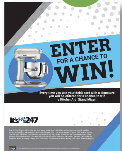
8.5 x 11 poster available for download