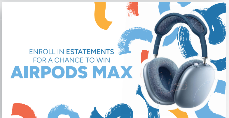
Social Media Banner